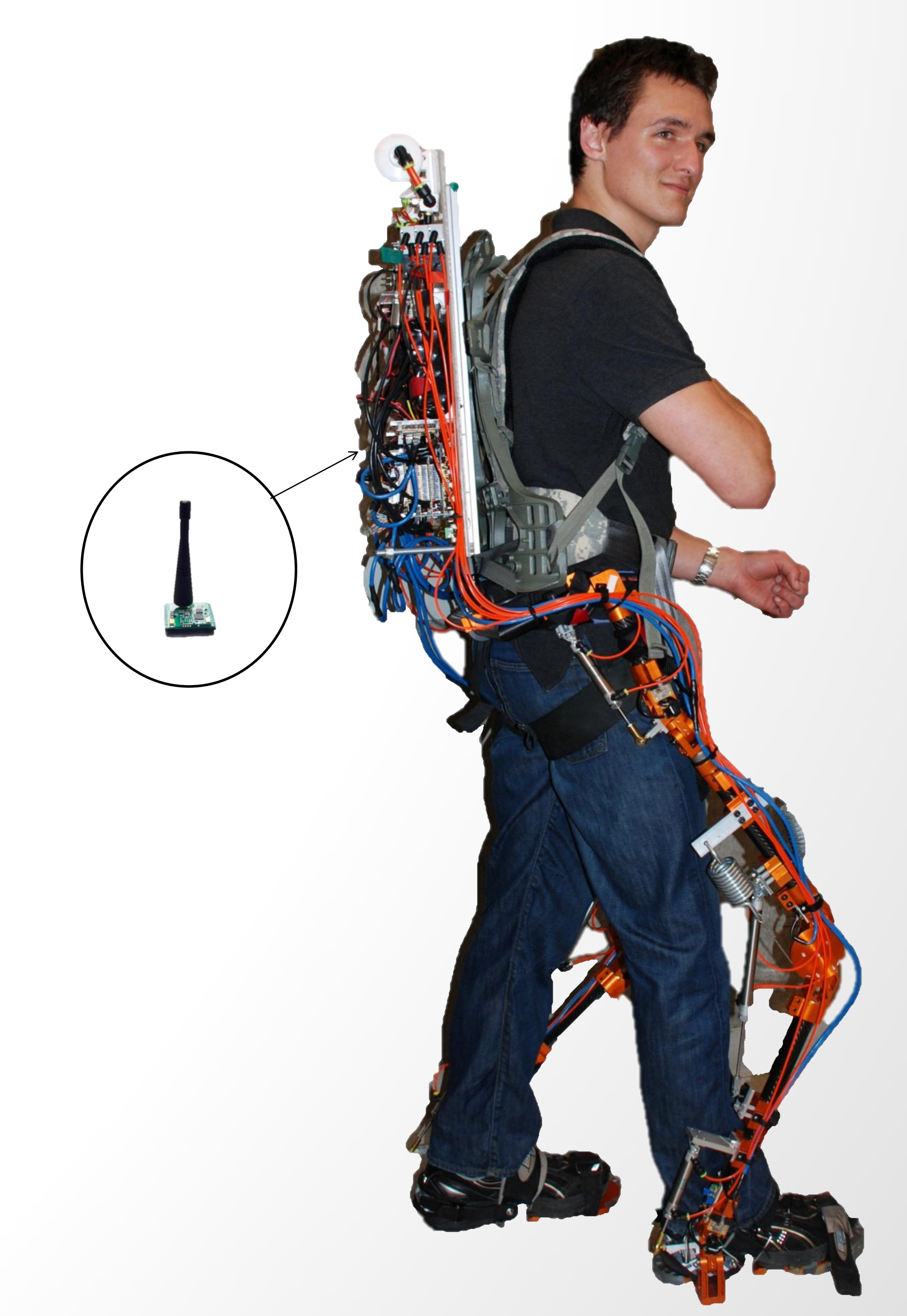
Concept of Wireless LEX System.

This work was sponsored by the National Science Foundation, SURF-IT (<u>surf-it.soe.ucsc.edu</u>) Research Experience for Undergraduates Program. NSF grant Award No. CNS-0852099. In addition, thanks to the University of California, Santa Cruz.