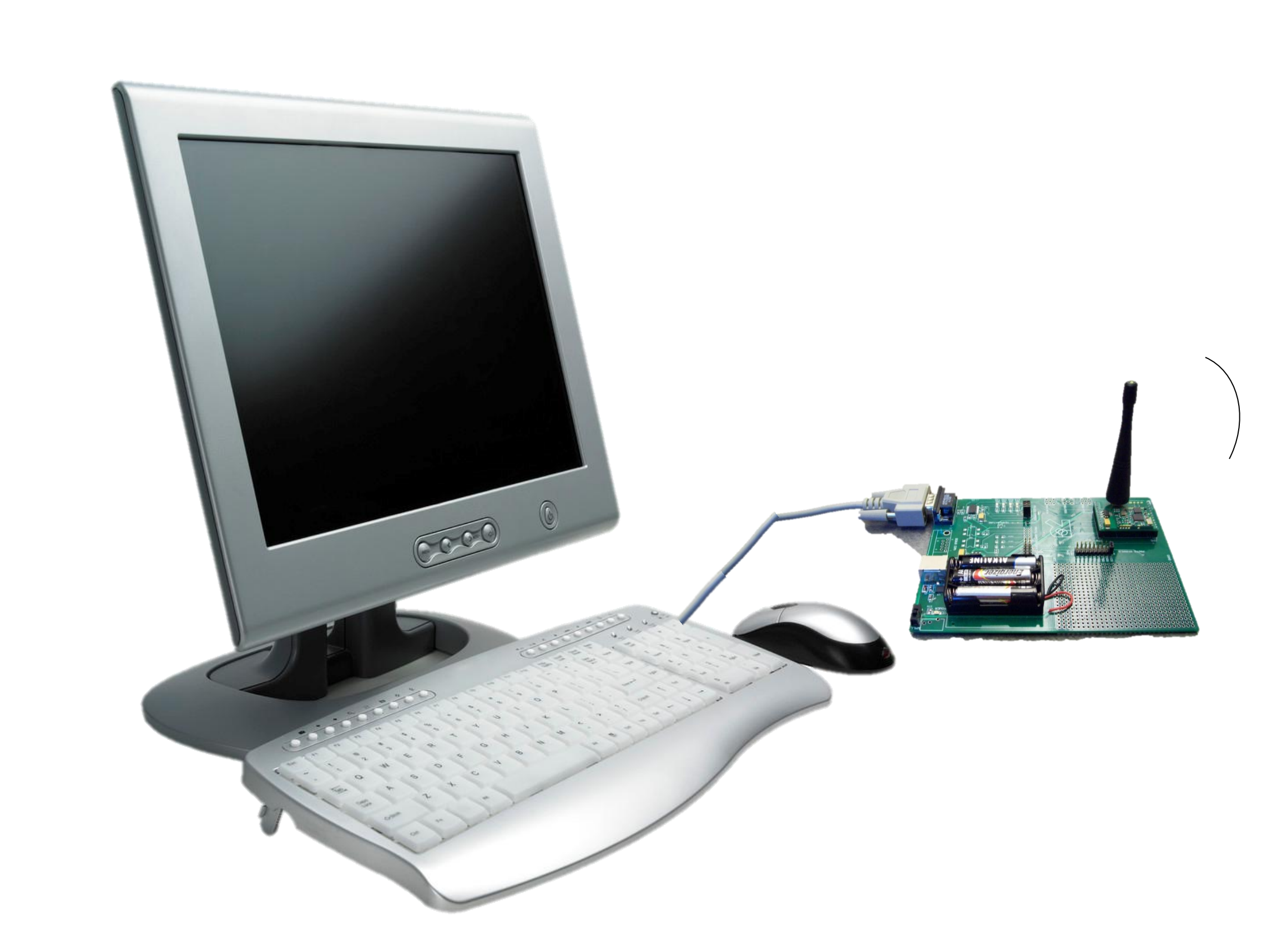
Picture from <a href="http://buffalocomputerconsulting.com/virus-removal.html">http://buffalocomputerconsulting.com/virus-removal.html</a>