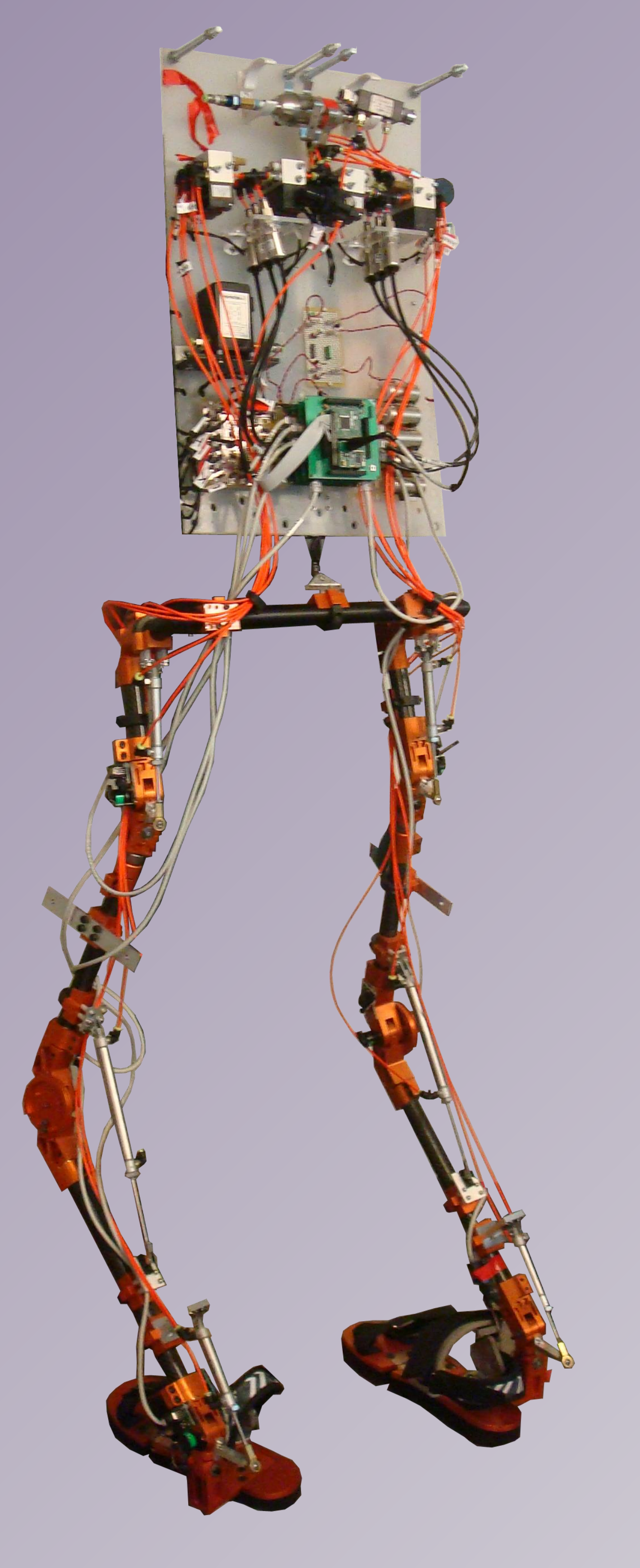
Lower Limb Exoskeleton.

The LEX system was developed to help soldiers carry heavy loads. The LEX is unique because it uses a pneumatic system which recycles energy from the knee and ankle and feeds it back into the hip and ankle which provides 10% of the needed power for the exoskeleton.